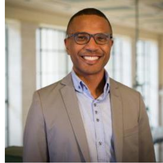
Assistant Professor of Biological Engineering