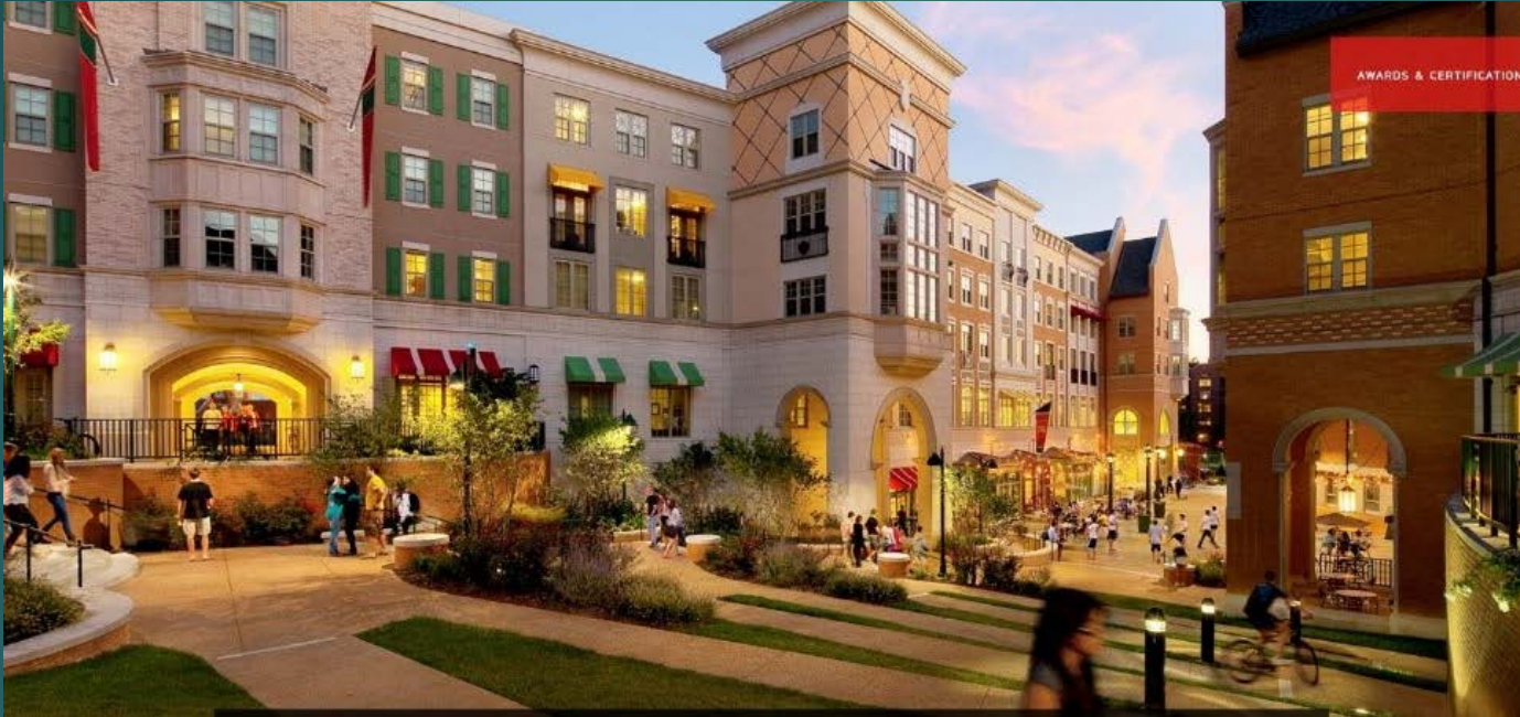
Artist's rendering of South Forty Residential College at Washington University of St. Louis

Full Benchmarking Committee Report at ailg.mit.edu/west-village